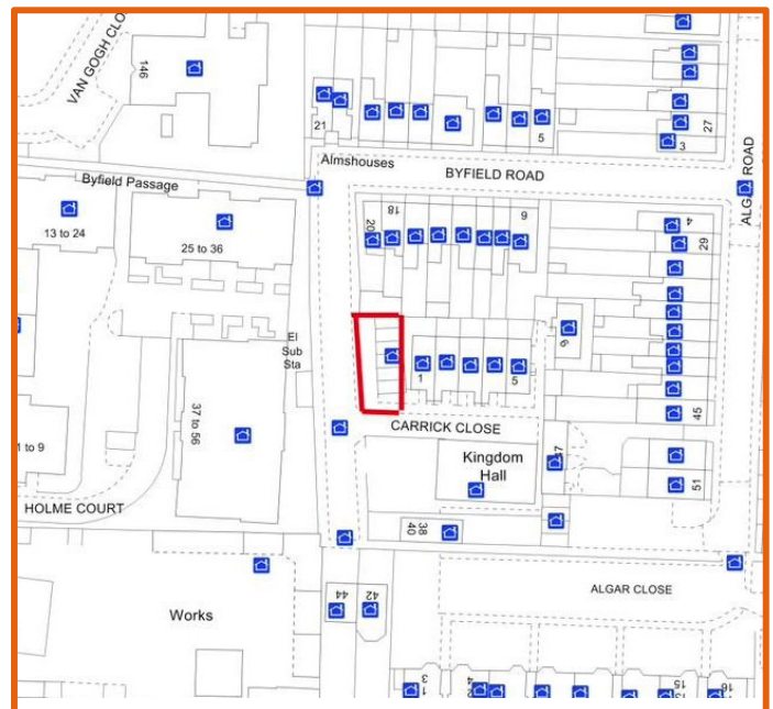
Figure 1: Site Location Plans