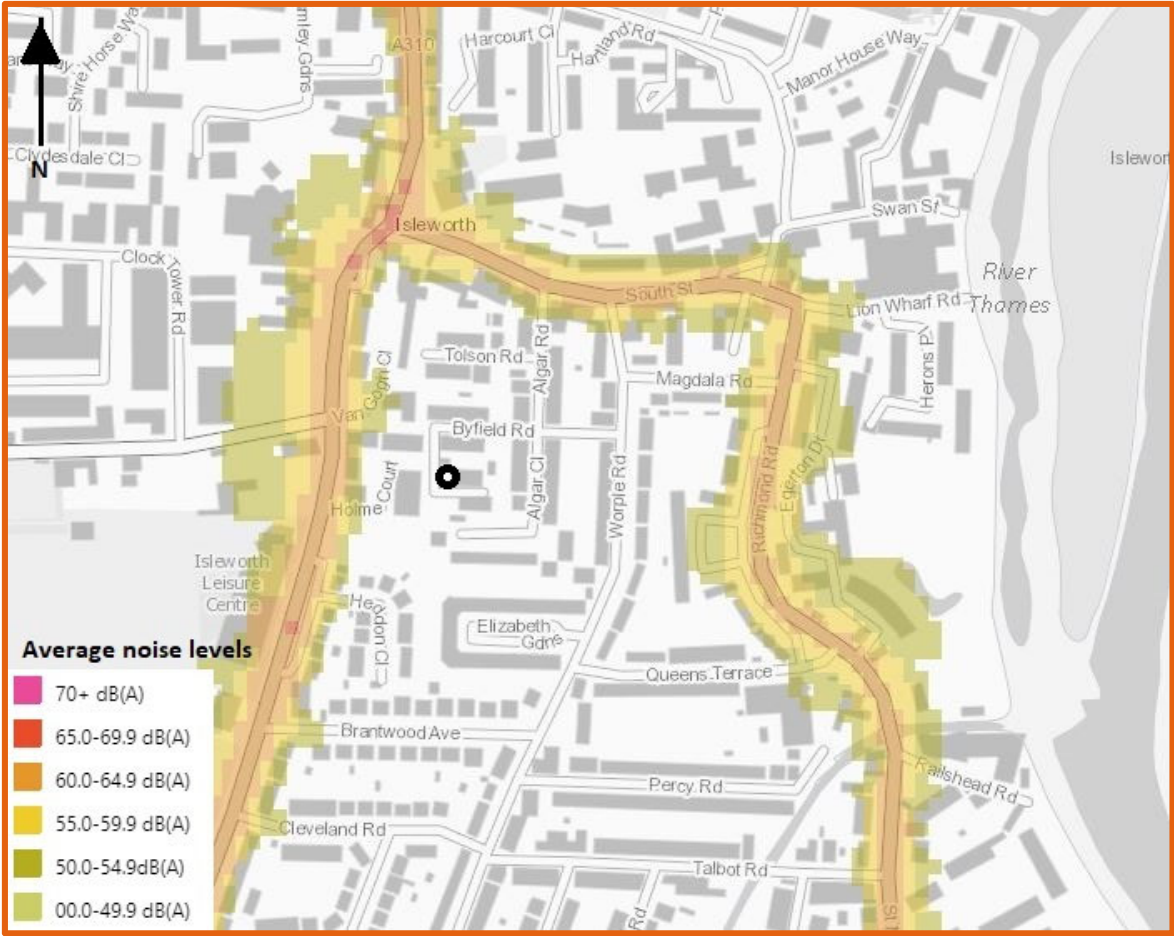
Figure 3: Defra Nlght road noise contour. Site 14 indicated by black marker.